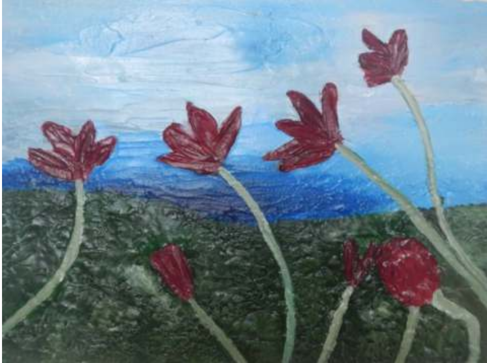
Floral Tribute to a Blue Sky - Mixed media on paper Private collector - Co Kerry