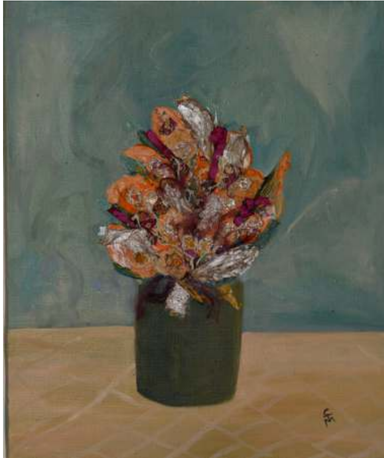
The Renaissance Flowers - Mixed media on Russian Linen Sold by Kilbaha Gallery - Private Collector USA