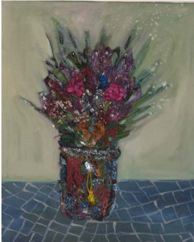
Tapestry Vase 1 - Mixed media on Russian linen Private collection - Co. Waterford