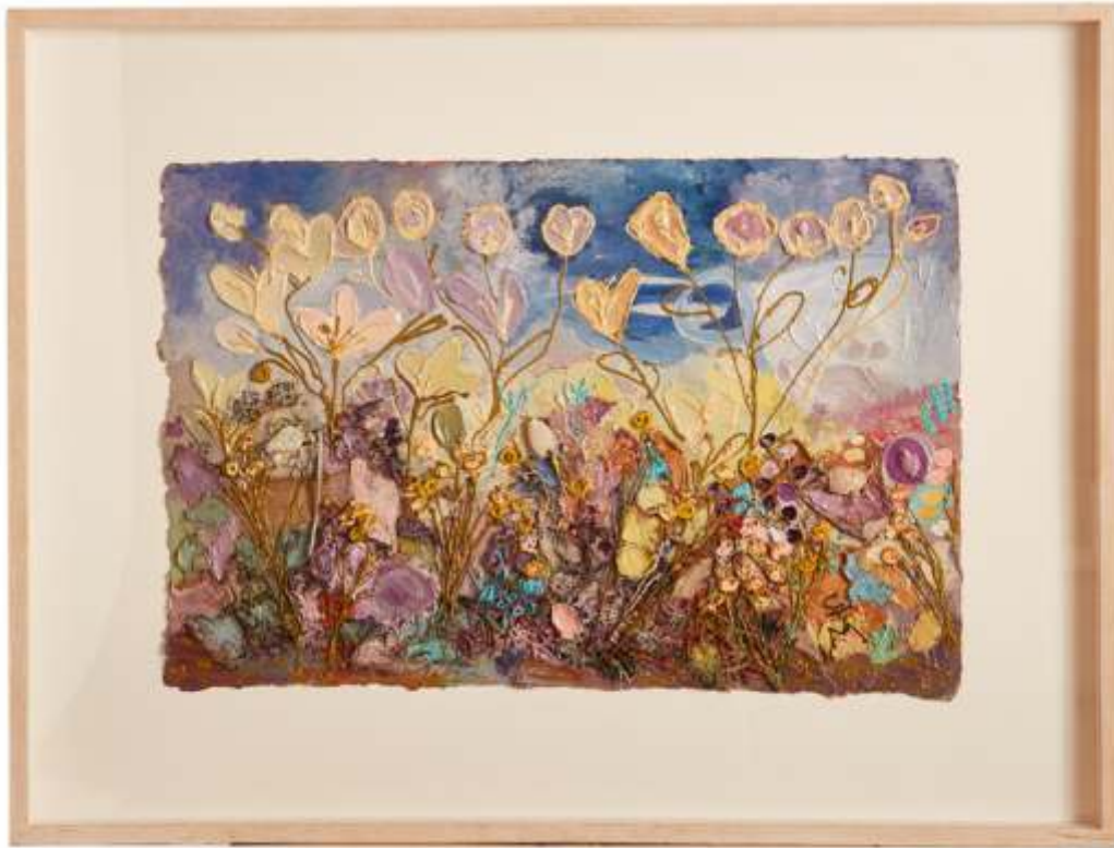
Earth Garden - mixed media on paper Private collection, Co Kerry