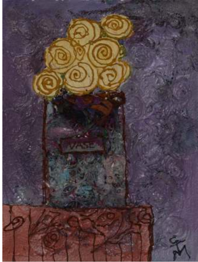
Tapestry Vase - Mixed media on paper Available for purchase