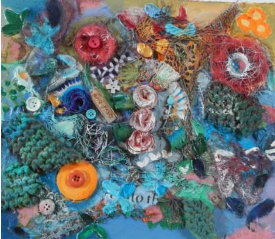
Textural Garden - Mixed media on paper Private collection - Co. Waterford