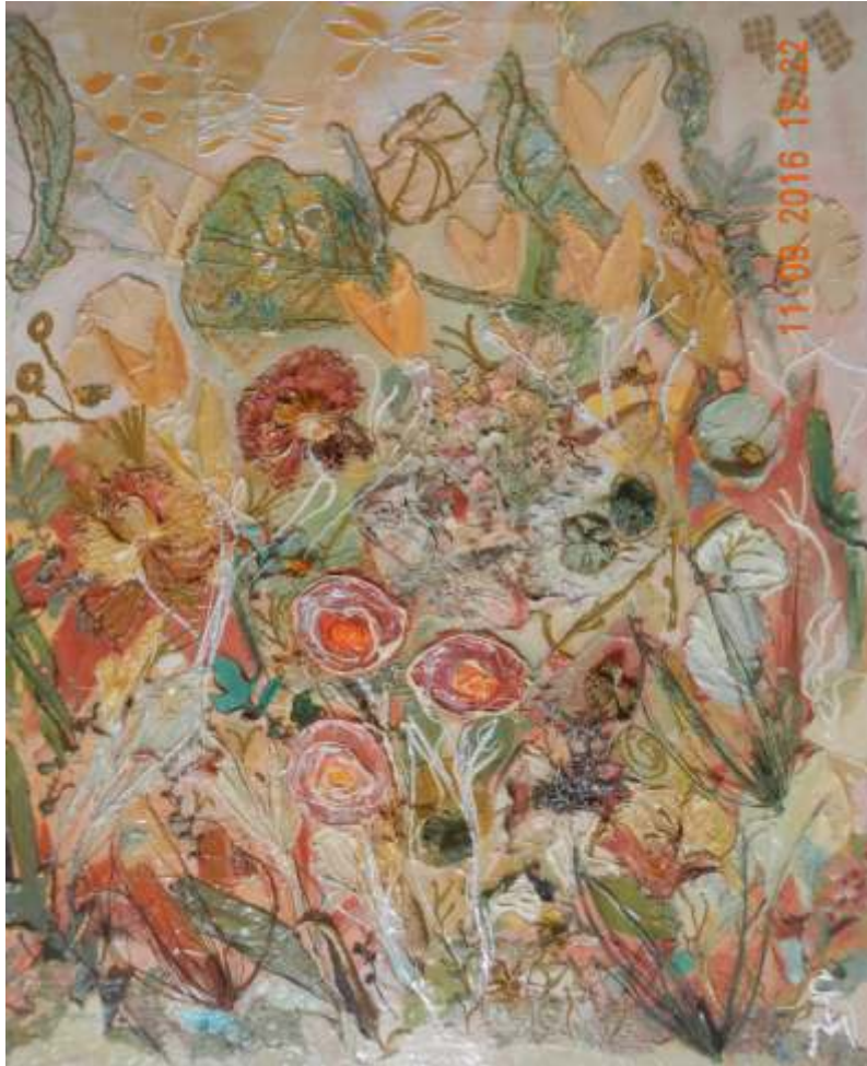
Special commission - mixed media on Russian linen Private Collection - Co. Clare