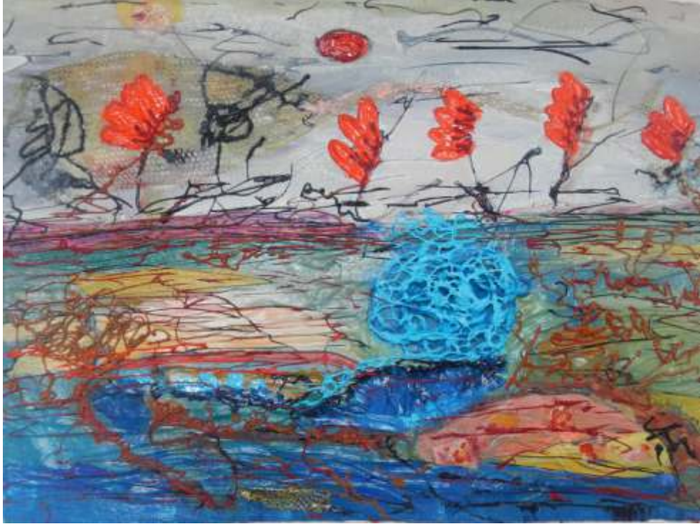
Flamenco Flowers - mixed media on paper Private Collection - Co Cork