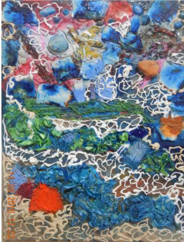
Lace makers Way - mixed media Russian linen Private collector - Co. Kerry