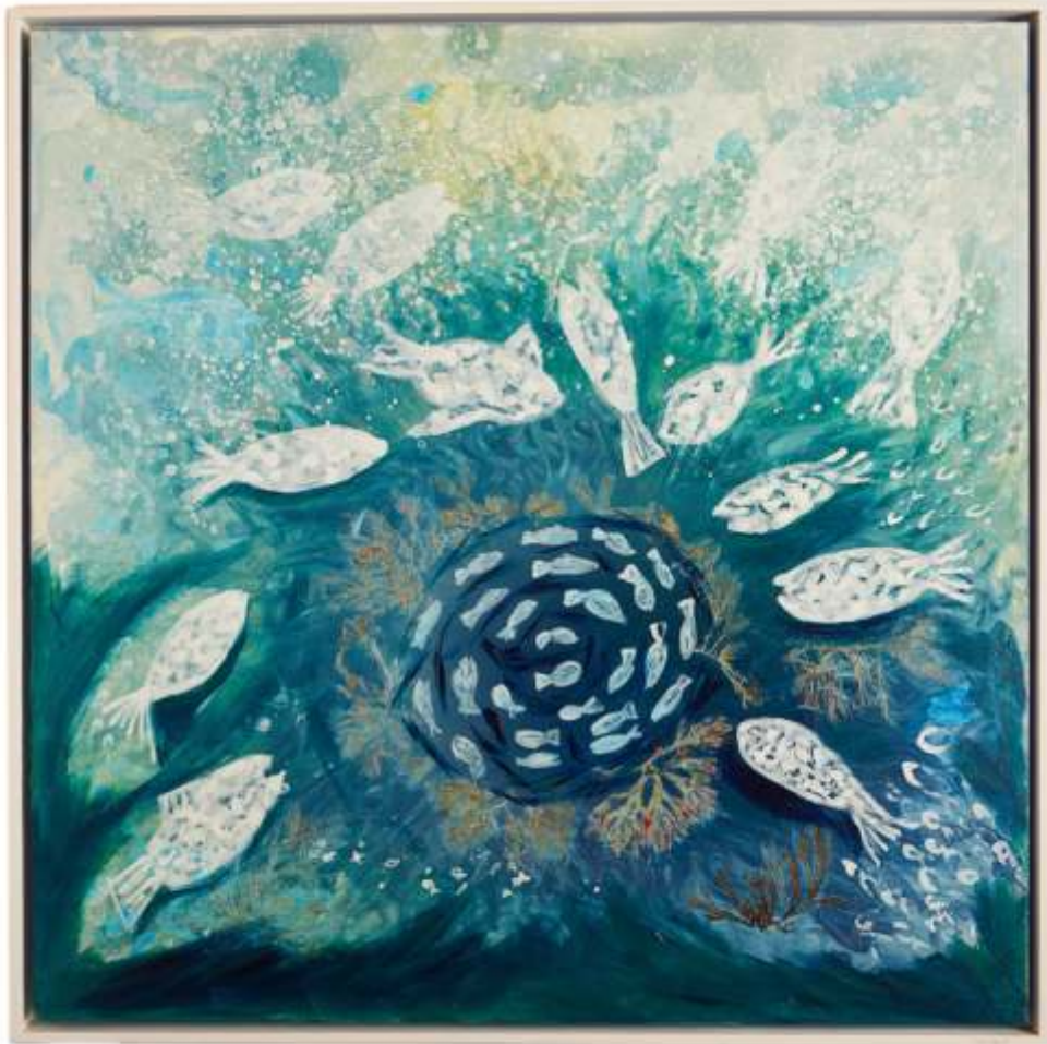
Fish Spray & Fish at Play - mixed media on Canvas