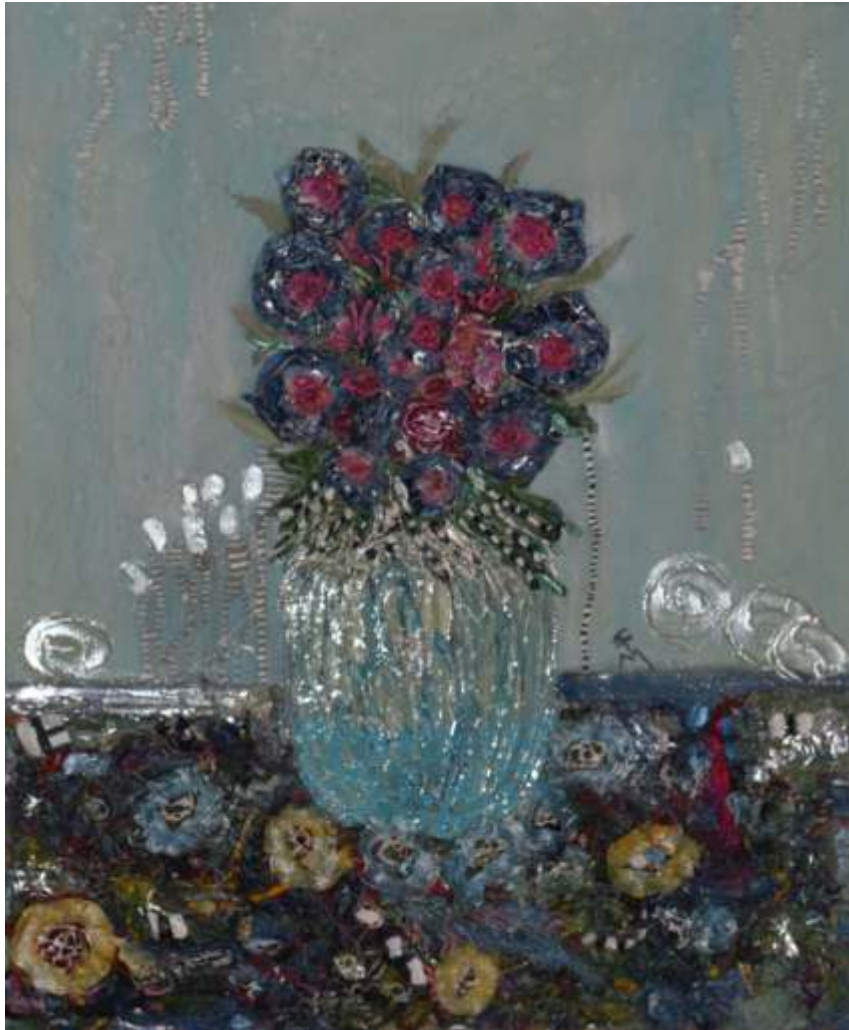
The Old Table Blooms - mixed media on Russian Linen Private Collector - Co Clare