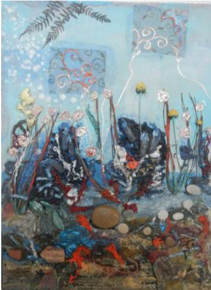
The Rockery Mixed media on paper