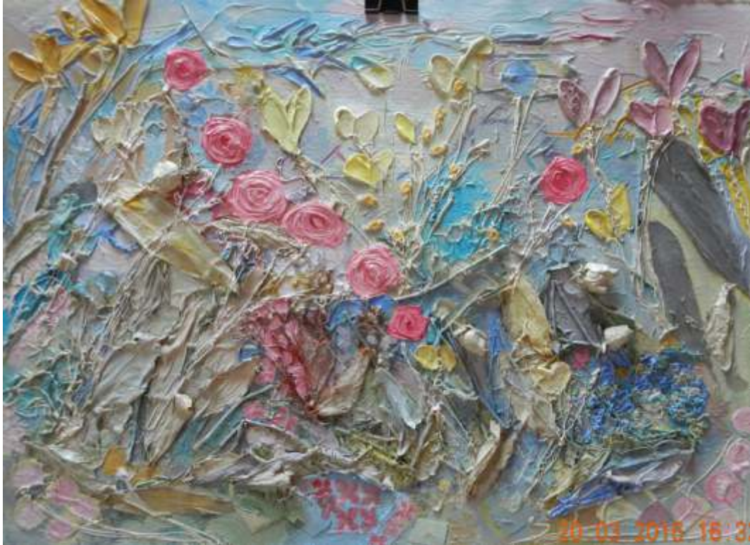
Heaven Scent - mixed media on paper Private collection, Co Waterford