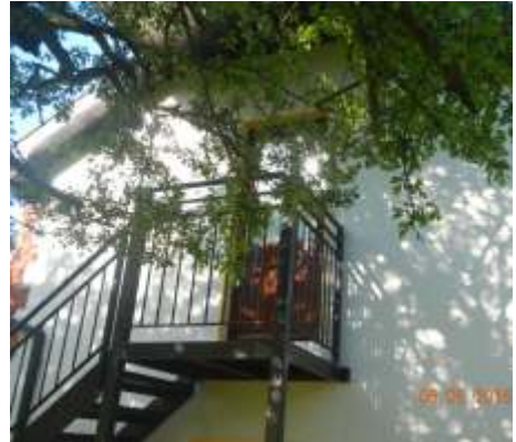
View from the Studio - 2016