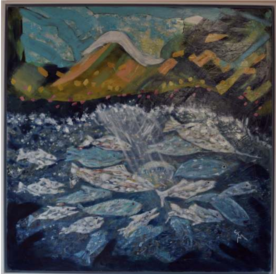
Wild Atlantic Fishambles - Mixed media on canvas